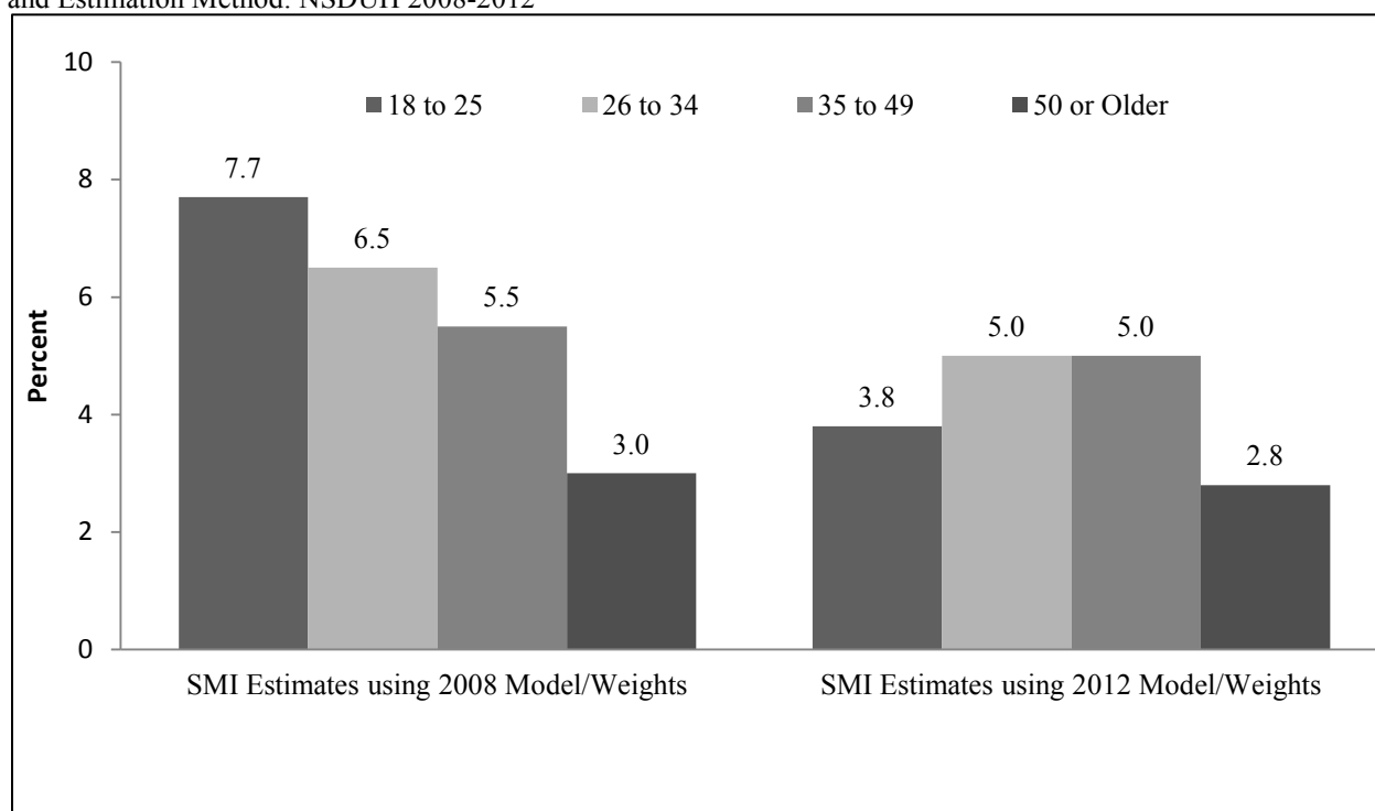
Figure 2. Estimates of Serious Mental Illness (SMI) in Past Year among Persons Aged 18 or Older, by Age Group and Estimation Method: NSDUH 2008-2012