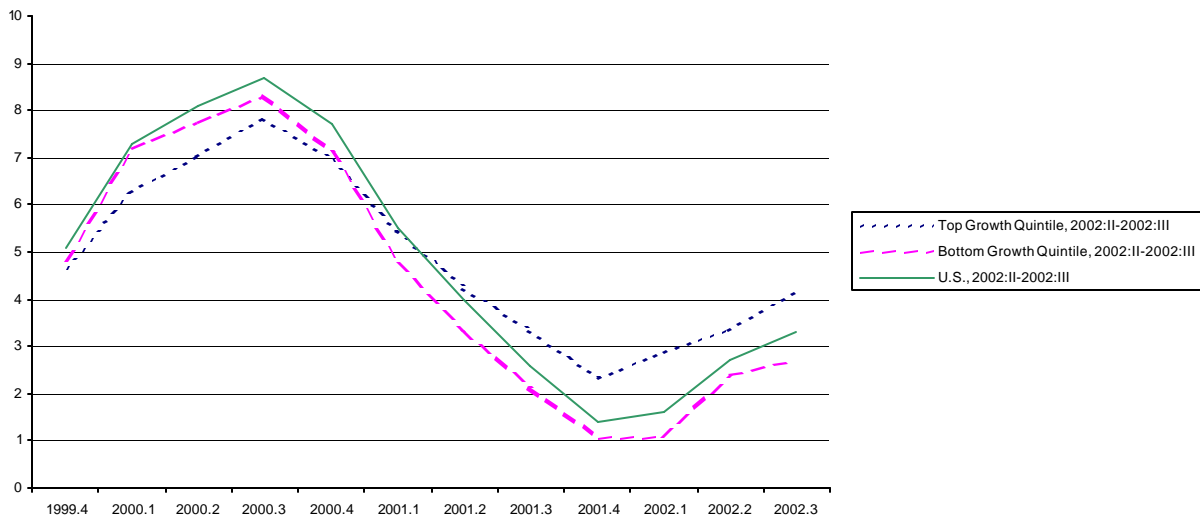
Personal Income Growth from Previous Year's Quarter

U.S. personal income increased 3.3 percent from the third quarter of 2001 to the third quarter of 2002, up from an increase of 2.7 percent from 2001:II-2002:II. After peaking at an 8.7 percent annual increase in the third quarter of 2000, the annual change in U.S. personal income declined through the end of 2001 and then began increasing. Similar growth trends are evident for the top- and bottom-growth quintile states, where the quintiles are based on ranks in third-quarter 2002 income growth (see map). However, these third-quarter 2002 high-growth states have not always out-performed others. While growth in personal income has been higher in the top-quintile states than in the bottom-quintile states since the fourth quarter of 2000, prior to that, the top-quintile states experienced slower-than-average growth.