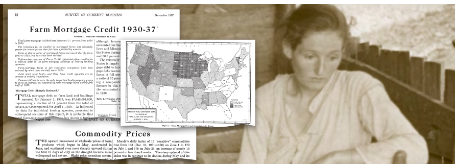
Photo. A destitute tenant farmer. October 1935.

Farm real estate values decline 31.4 percent from 1930 to 1935. In 1931, farm product prices drop below 1913 levels. The drought is "the worst in our history" and by 1936 becomes "more widespread and severe."