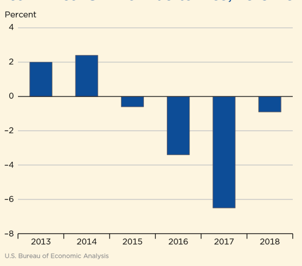
Chart A. Percent Change from Preceding Year in Real GDP for Puerto Rico. 2013–2018

As measured by real GDP, Puerto Rico's economy grew in 2013 and 2014 and then declined in each year after, with the steepest decline in 2017, the year of Hurricanes Maria and Irma. Real GDP growth rates are shown in chart A.