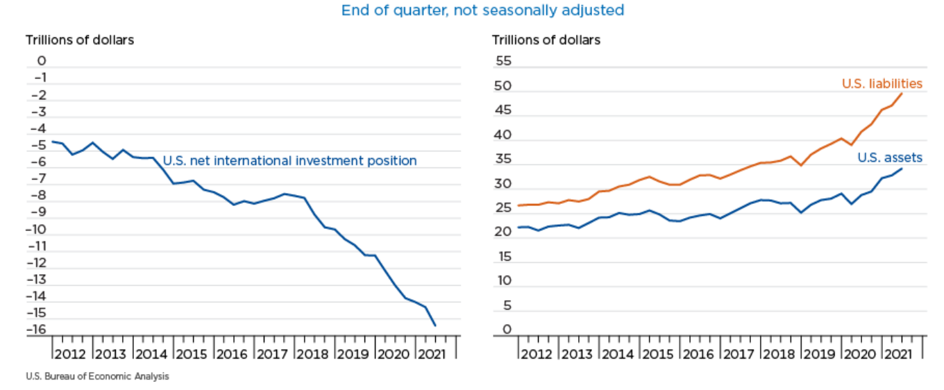
Chart 1. U.S. International Investment Position

The -$1.12 trillion change in the net investment position from the first quarter to the second quarter came from net financial transactions of -$277.6 billion and net other changes in position, such as price and exchange rate changes, of -$841.4 billion that mostly reflected U.S. stock price increases that exceeded foreign stock price increases (table A).