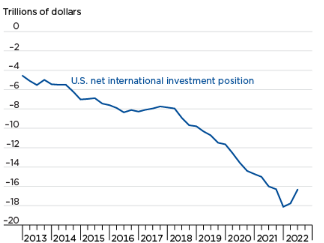
Chart 1. U.S. International Investment Position End of quarter, not seasonally adjusted

The $1.44 trillion change in the net investment position from the first quarter to the second quarter came from net financial transactions of -$139.1 billion and net other changes in position, such as price and exchange-rate changes, of $1.58 trillion. Net other changes mostly reflected U.S. stock price decreases that exceeded foreign stock price decreases, which lowered the value of U.S. liabilities more than U.S. assets (table A).